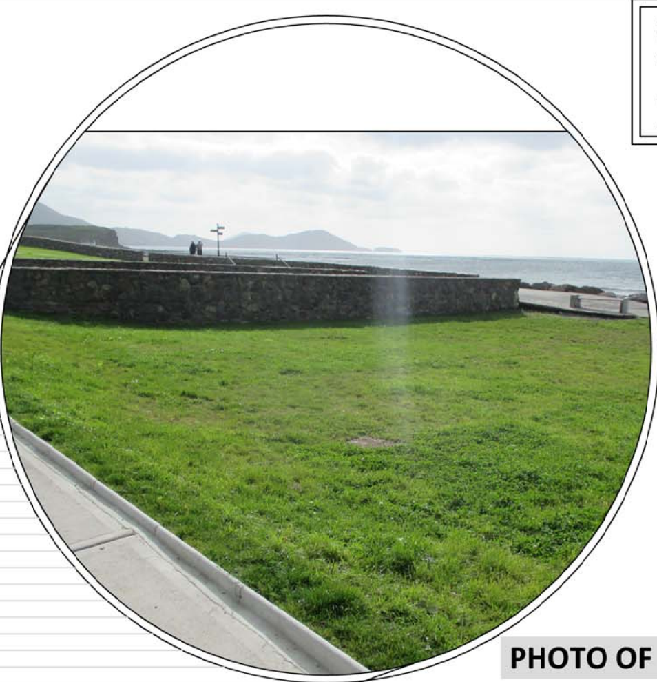
PHOTO OF SITE.