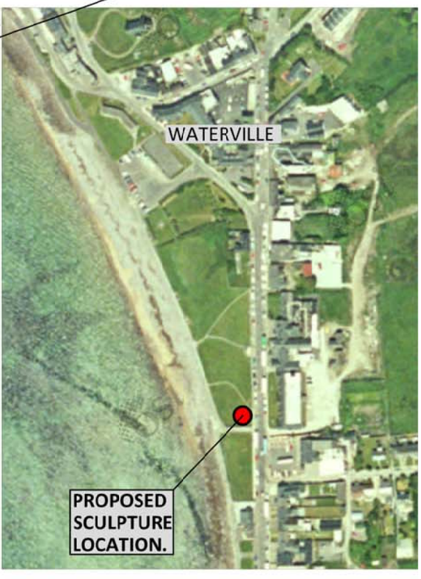
AERIAL SITE MAP