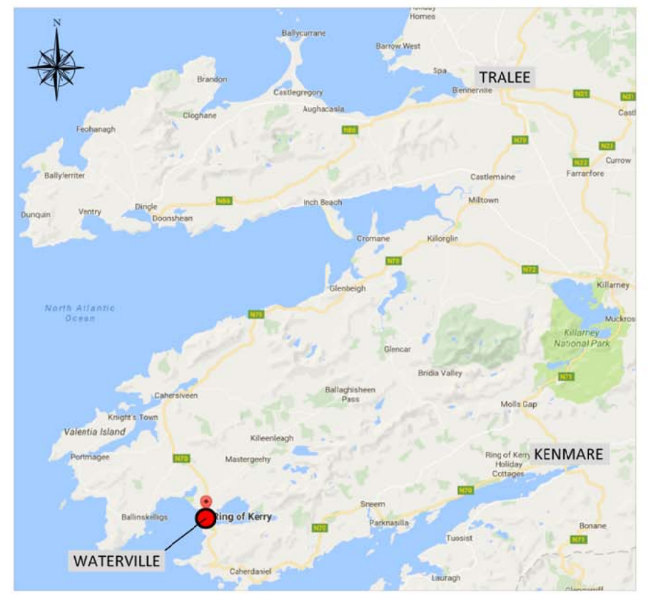
COUNTY LOCATION MAP